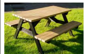
Pavilions are available for rental at North Middleton Park, Village Park and Creekview Park