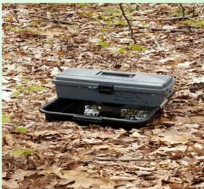
Shown above is the data collection trap that is used to collect the species of mosquito that commonly carries West Nile Virus.

For questions or additional information, please contact the Cumberland County Vector Control via email at vector@ccpa.net or by telephone at 717.240.6349. You can also visit their website at www.ccpa.net/vector