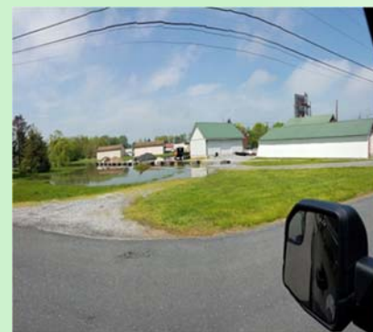
Areas of standing water like the one pictured are common throughout the county and are monitored for virus activity frequently.